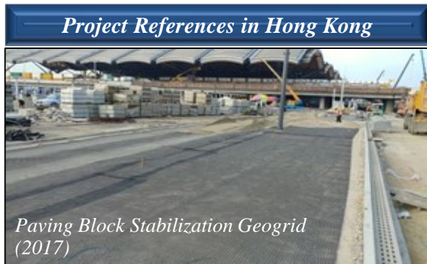
Project References in Hong Kong Paving Block Stabilization Geogrid (2017)