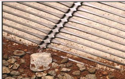
Uni-Axial Geogrid Reinforced Fill Slope and Wall