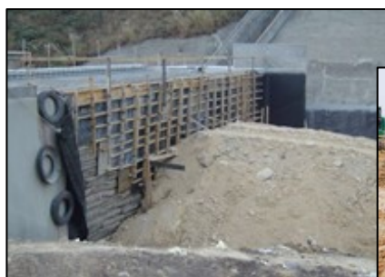
Mechanical Stabilized Earth Wall (MSEW)(2007)