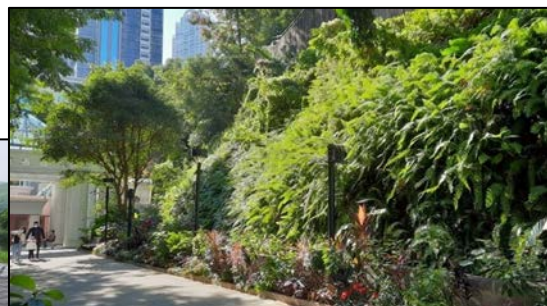
Hong Kong Park Reinforced Fill Slope (2021)

Together with Tensar, we endeavour to provide effective solution (design brain in Kuala Lumpur and UK), economical product (production in India and China) and efficient logistic (delivery from Changsha).