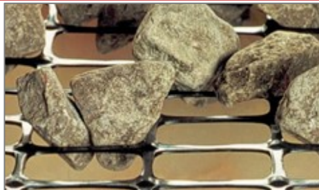
Bi-Axial Geogrid Soil Reinforced