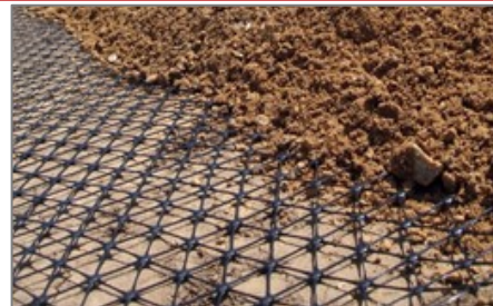
Tri-Axial Geogrid Ground Stabilization in Weak Subgrade