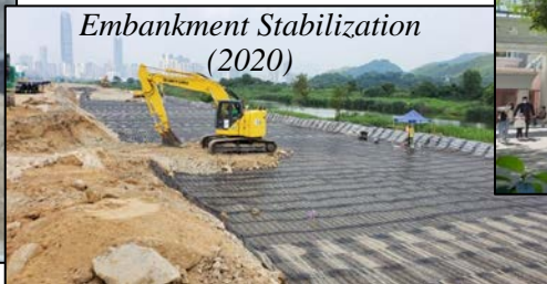
Embankment Stabilization (2020)