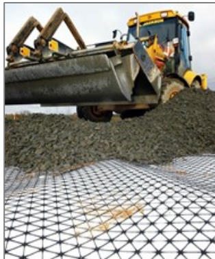
Composite Geogrid with Geotextile Reinforcement and Separation